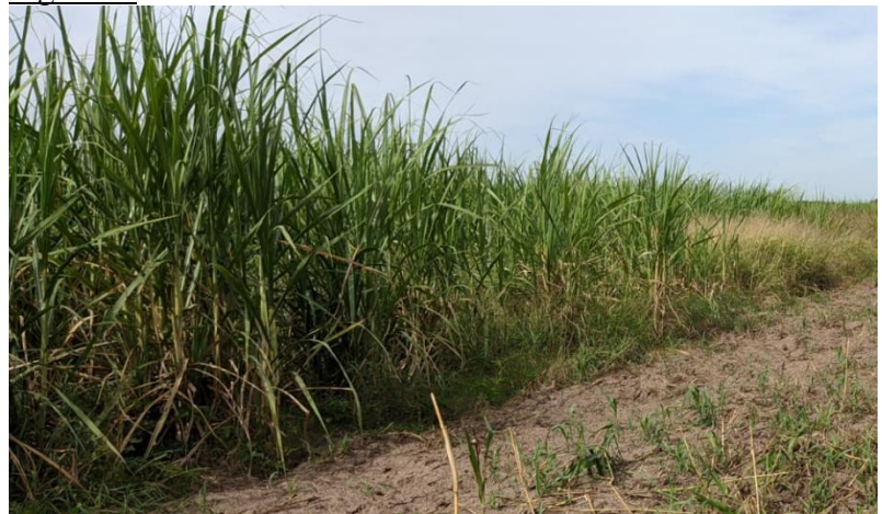
Drought-affected sugarcane field in Southern Tucuman.

Every year before the harvest begins, the local sugar sector estimates the likely production of sugarcane and its sugar equivalent and then how much will be needed to fully supply domestic sugar demand. The remaining volume is then divided between the production of sugar for the export market and/or for ethanol to meet the national biofuel mandate. The final distribution at the end of the marketing year depends on how the different markets evolved. Like any business, sugar mills try to maximize returns and move quickly in response to domestic and world sugar