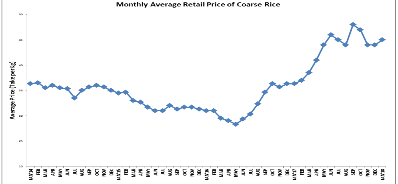
Figure 1. Bangladesh: Monthly Retail Prices of Coarse Rice Monthly Average Retail Price of Coarse Rice

Source: Department of Agricultural Marketing, and Trading Corporation of Bangladesh Policy: