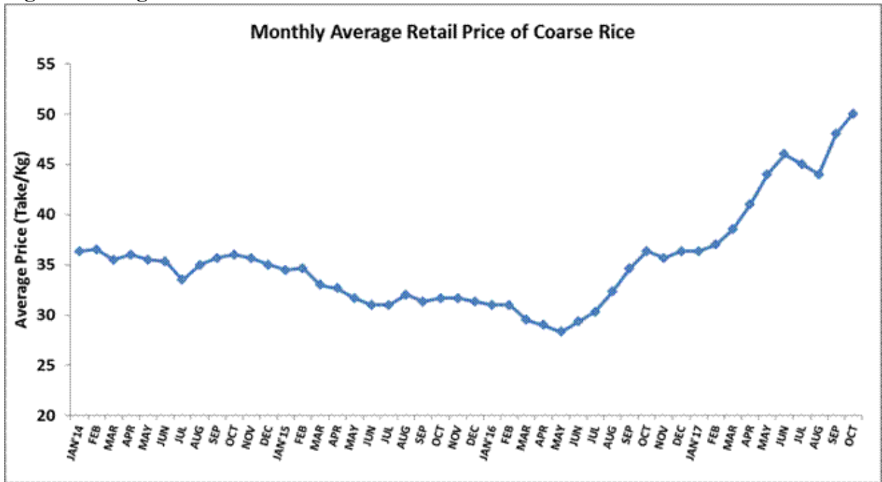
Figure 1: Bangladesh- Coarse Rice Prices

To aid the sale, the GOB subsidized the price through its Open Market Sales (OMS) program at BDT 30 (US$ 0.37) per kg, which was a subsidy of about BDT 15. OMS support to the poor is needed, but subsidized prices that are still almost BDT 20 - 30 higher than consumer expectations are beyond the budget of many consumers. They buy parboiled rice instead of White (Atap) rice for daily consumption. Because the volume is so low, rice sales through the OMS program have minimal impact on prices even though the price in coarse rice in the open market was BDT 54 per kg, compared with the OMS program sales price at BDT 30 per kg.