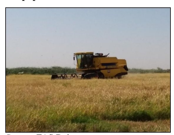
Photo 3. Senegal: More Mechanized Farm Equipment is available in the SRV