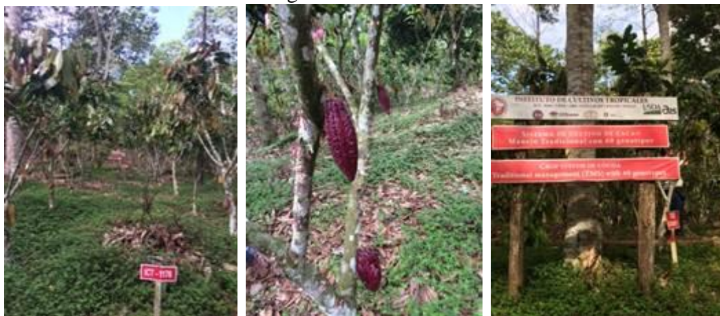
Picture 1: Cocoa plantation at the Tropical Crop Institute's research station. This program is partially funded by USDA's Agricultural Research Service.

spruceanum ) for lumber to complement their income once cocoa plants are producing, and also provide shade once the banana trees are gone.