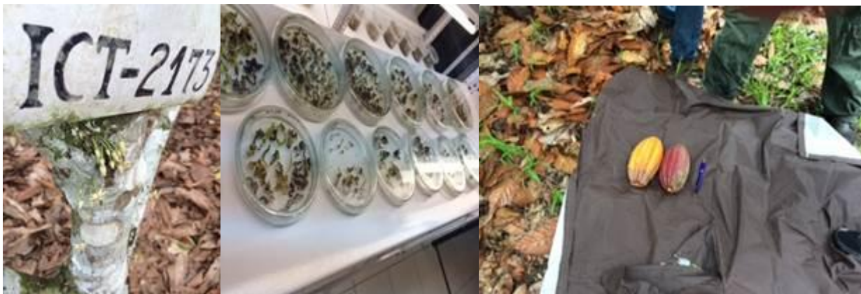
Picture 3: Selected cocoa varieties are cloned in biotechnology laboratories and then distributed to farmers.

As part of its strategy to encourage cocoa producers to participate in their programs, ACP has instituted the Cocoa de Oro (Golden Cocoa) award for farmers that produce the best quality cocoa. The ACP, along with the Ministry of Agriculture and Irrigation, DEVIDA and USAID, has also established the “Salon del Cocoa y Chocolate”, an exhibition to promote cocoa production and consumption. Winners of this event participate in the Salon du Chocolat in Paris. In 2009, a Peruvian sample won the first prize for aromatic cocoa, and in 2011, Peruvian cocoa samples were selected among the best in the world. In 2014, 35 small producers have been selected to participate in the Paris show.