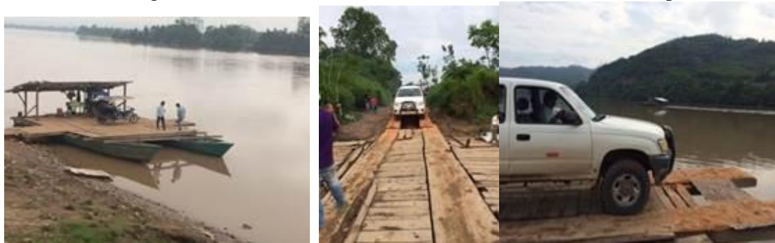
Picture 2: Lack of infrastructure, particularly roads, continue to be a major hurdle for cocoa producers who frequently have to cross rivers in these rudimentary barges.

Cocoa farms are usually located in remote areas accessible only through rough dirt roads, which in the rainy season are almost impossible to drive on. Sometimes farmers have to put their trucks on barges to cross rivers and get to a main road which drives commercialization costs up.