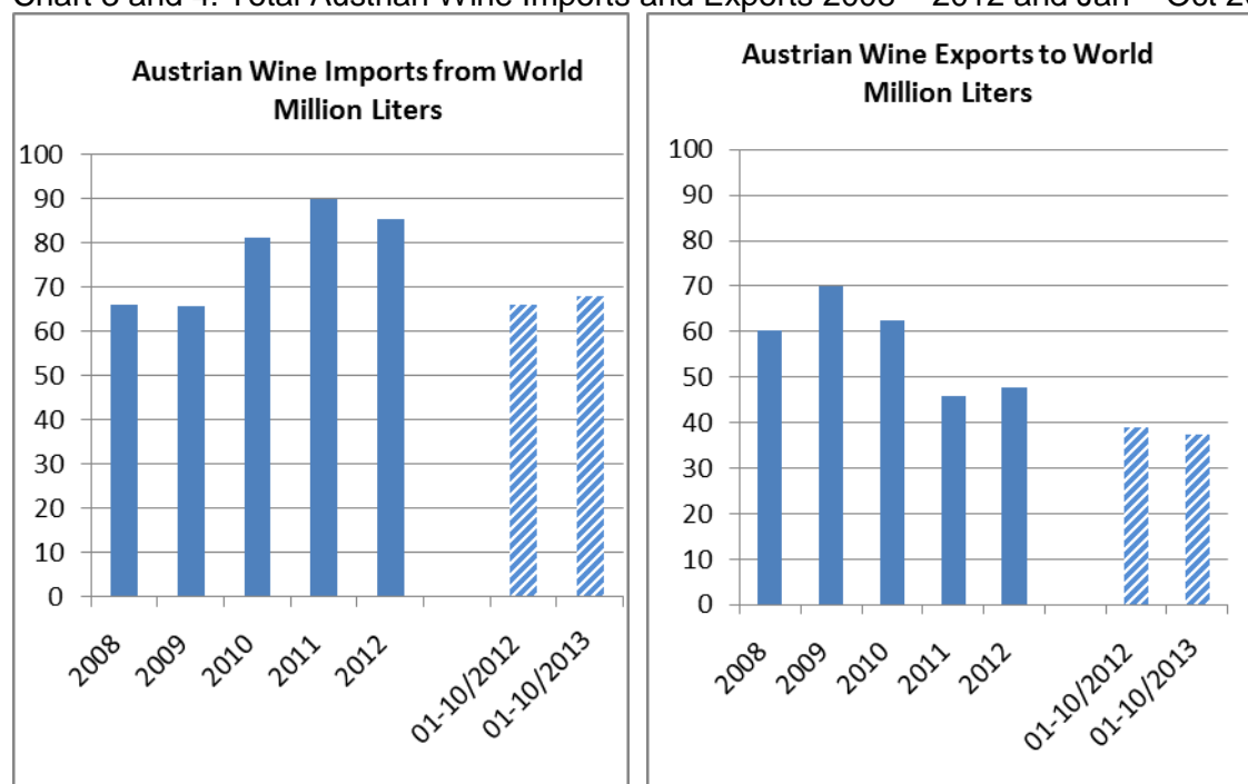
Chart 3 and 4: Total Austrian Wine Imports and Exports 2008 – 2012 and Jan – Oct 2012 and 2013

The first 10 months of 2013 showed an import increase of 3.2 percent whereas exports dropped by 3.9 percent. The somewhat better crop in 2013, together with somewhat higher stocks (wine in storage), leads to the expectation that imports may decrease modestly in 2014 and that exports will increase.