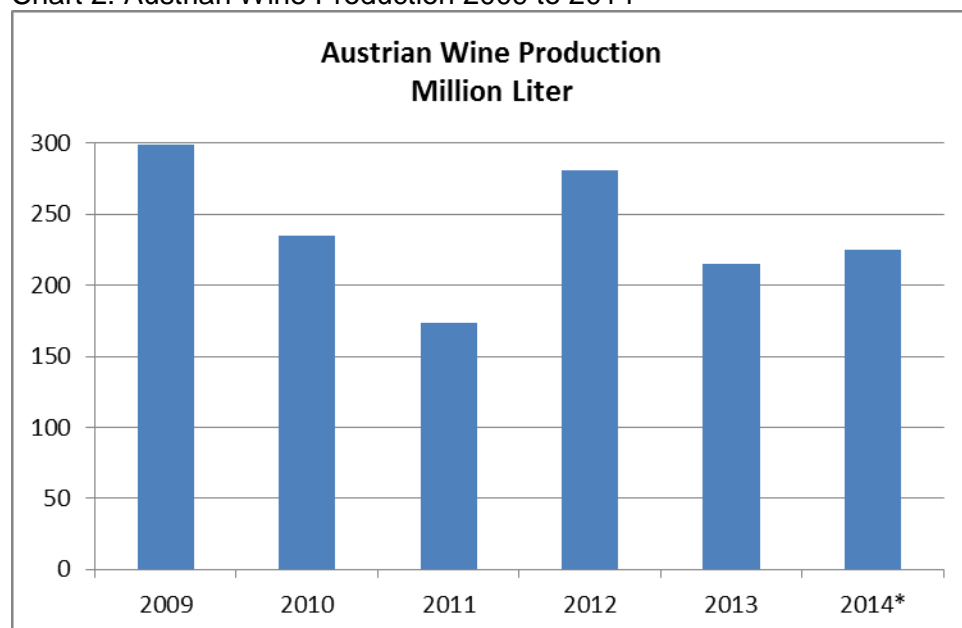
Chart 2: Austrian Wine Production 2009 to 2014

The wine production year indicates the year following the grape harvest.